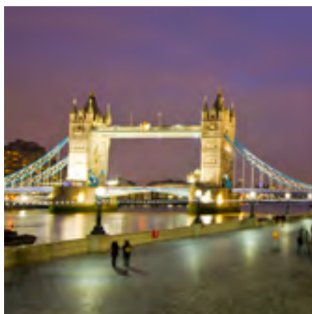
Our team service the whole of London and the Home Counties

Scheduled maintenance, replacement services, emergency care and planning advice in London and the Home Counties.