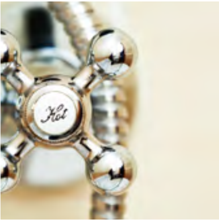
Water is a vital part of any business

Just like power, water is a vital part of any business. Keeping a reliable supply is essential if you look after drainage, pipes and toilets that serve tenants or workers. Planned servicing and support is the best way to keep the water flowing but Charles Fairing also offers a round-the-clock emergency care service for when you might spring a leak or even a deluge. We help all types of businesses with water solutions, from modest offices to sprawling sites.