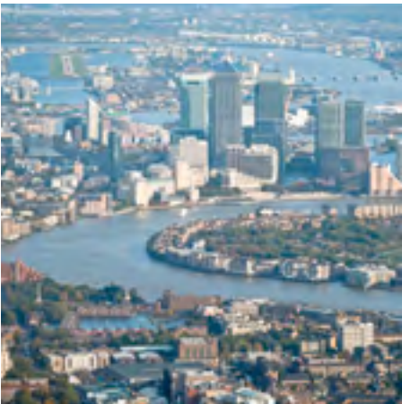
We service the whole of London and the South East

At Charles Fairing we are dedicated to ensuring your business runs smoothly. We look after businesses, buildings and plant rooms of all sites, and our aim is to keep your systems in the best condition through regular servicing. However, if something does break down, our expert team will arrive on-site with a solution and the skill to repair or replace first time. Our engineers and service managers specialise in preventive plant maintenance within the guidelines of the B&ES and SFG2 regulations.