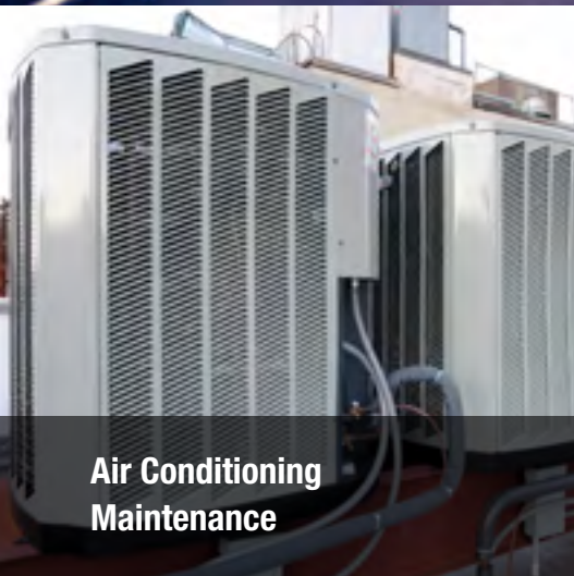
Air Conditioning Maintenance